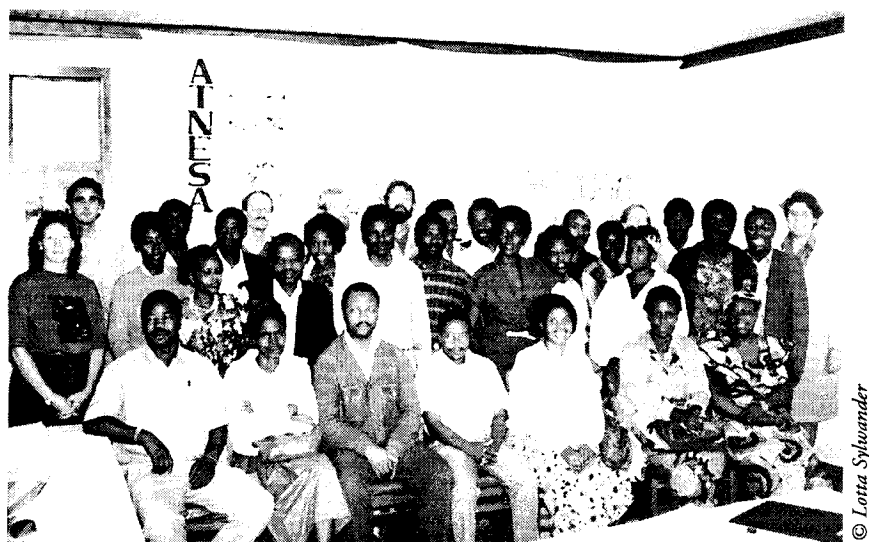
Participants at Gender Issues in Animal Traction Workshop