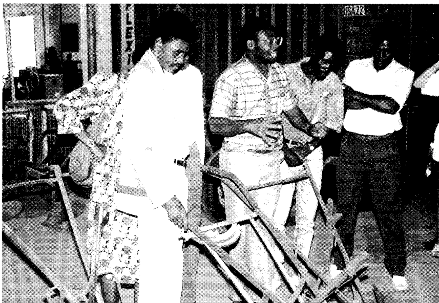
Participants visit MOP workshop

A central element of the workshop was field visits. The interaction with farmers through the field visits improved participants understanding of farmers problems and changed their perception. The